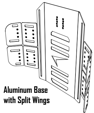
Aluminum Base with Split Wings