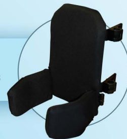
Available in a variety of sizes