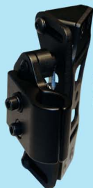
ADI Mounting Hardware