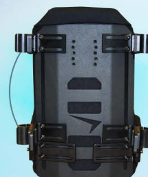
Lightweight Back with integrated tracks for easy wings and lateral support installation