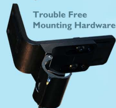
Trouble Free Mounting Hardware