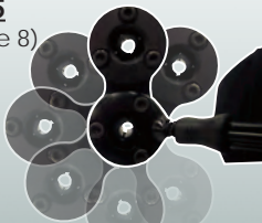
Includes a standard 9" rod and egg switch mount.

Figure 8 mounts are uniquely designed to provide 240 degree rotation capability for a second pad, switch or embedded speaker on a traditional Swing-Away.