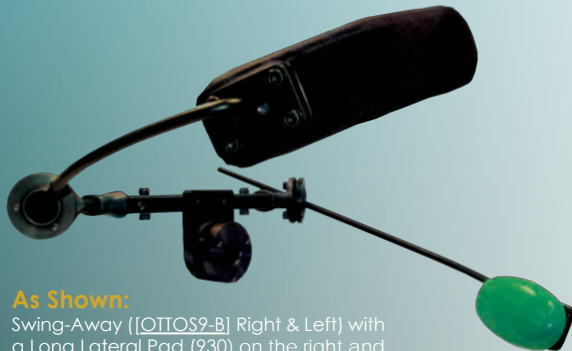
As Shown: Swing-Away ([OTTOS9-B] Right & Left) with a Long Lateral Pad (930) on the right and a Green Egg Switch (ESGRN) on the left.

Swing-Away arms offer a sleek, unobtrusive design while featuring an easy, one-hand release mechanism for swinging pads and switches back a full 100 degrees. This ensures convenience and is important for transfers, therapy and fatigue issues. Swing-Away pads or switches can be quickly and easily locked back into their original setting.