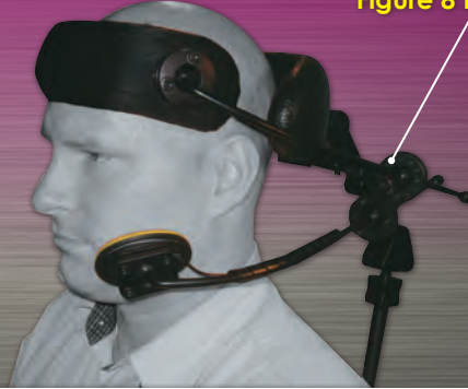
Figure 8 Bracket

Includes: Small OB Headrest ( STL-OTS250 ) with Link Hardware ( TWB480-1" ) and Flip Down Mount ( FDM380 ), Swing-Away ([ OTTOS9-L ] Left) with Figure 8 Bracket ( F8675 ), Long Facial Lateral Pad ( 920 ) and Yellow Egg Switch ( ESYEL ).