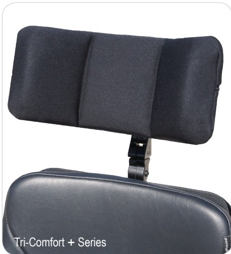
Tri-Comfort + Series

The Combo (CB) series is a winged style headrest that cradles the head without having additional head supports. It consists of a posterior pad and two lateral pads.