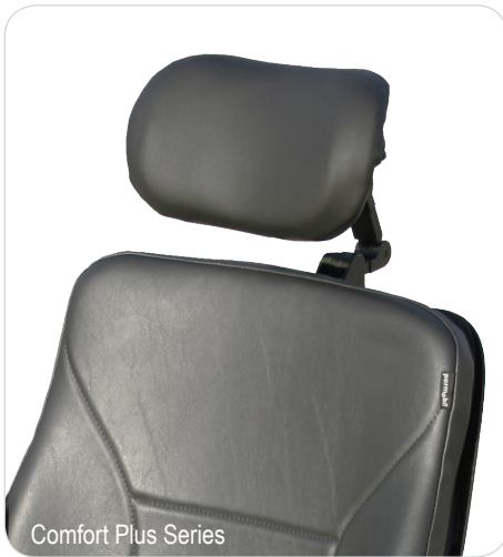
Comfort Plus Series

For standard head support we offer our Comfort Plus (CP) series. This headrest can be equipped with embedded egg or proximity switches for a sleek look.